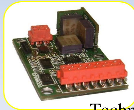
Technaid family of IMUs