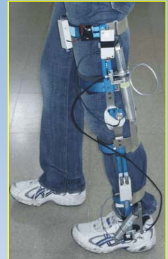
CSIC, Ossur work on exoskeletons