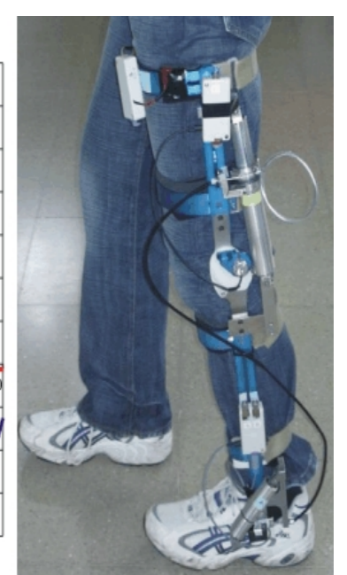
Fig. 2. GAIT orthosis with a torque diagram of the semi-active function during a normal walking cycle.